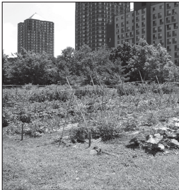
More than 90 varieties of vegetables, flowers, and herbs were grown at this busy inner-city location on Laurel Street.