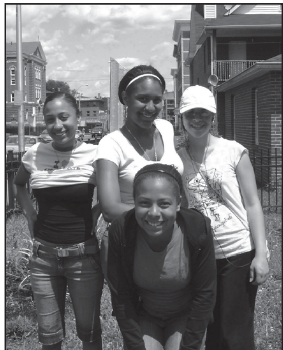
Members of the Grow Hartford Youth Crew at the Broad Street garden, one of three growing sites in 2009.

Grow Hartford is an urban farm in its seventh season located on three different sites in Hartford's inner city on Laurel, Broad and Zion Streets. These sites serve as outdoor classrooms to learn hands-on about making healthy food choices, understanding the food system and understanding how agriculture and food choices affect our community.