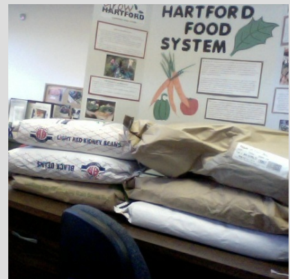
A pile of oats and beans sitting in our office! A generous donation from Whole Foods to be used towards our Community Kitchen program.