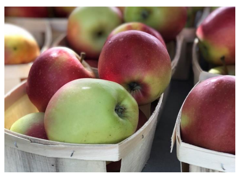
Connecticut apples for sale at the North End Farmers' Market.

In order to address the barriers to healthy and affordable food for many Hartford residents, the Food Policy Commission has been working on the following recommendations identified in 2017 to improve food access, sustainability, and security. Working on these same issues for the last few years has allowed the Commission to delve deeper into these subjects and develop more targeted recommendations this year. The purpose of this report is to provide City leadership with recommendations to improve the food system in Hartford and to raise awareness about the persistent food insecurity that affects many Hartford residents.