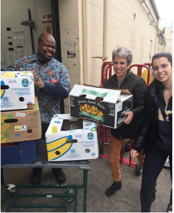
Volunteers with Food Rescue US pick up donated food from Trader Joe's in West Hartford which would have otherwise been thrown out.

The Commission will promote the use of residential composters, including through giveaways and sales where possible. The Commission will continue to work with Trinity College on their food recovery and composting efforts.