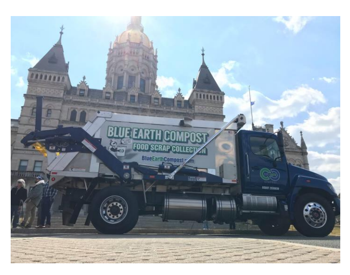
Blue Earth Compost unveiled its food scrap collection truck earlier this year, indicating increased interest in reducing food waste in the Greater Hartford Area.

HOW? The Hartford Advisory Commission on Food Policy will raise awareness of food waste, facilitate conversations for a food recovery program, and convene an informational meeting for restaurants to compost. Community organizations can share data about food waste.