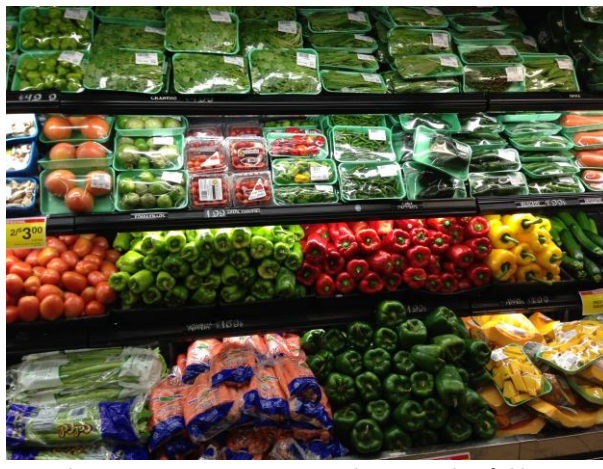
Produce section at C-Town Supermarket on Wethersfield Ave.

HOW? The Hartford Advisory Commission on Food Policy advised the City to publicly identify healthy food retail as an economic priority. Healthy food retailers, specifically midsize grocery stores, must be recognized as community assets.