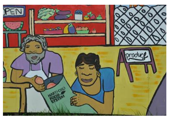
Part of a mural at the Grow Hartford garden at the corner of Main and Park Street.

The original goals of the Commission continue to be relevant today. A study by the University of Connecticut to evaluate community food security across all 169 Connecticut towns found that Hartford's population is the most at risk of food insecurity above any other town in the state (University of Connecticut 2012). Food insecurity is defined as the inability to access enough food for an active and healthy life at all times. Significant socioeconomic and health disparities, including limited and inconsistent access to affordable and healthy foods persist in Hartford and the Greater Hartford area. At $33,841, the median household income in Hartford is less than half of that of Hartford County at large. Furthermore, 30.5% of Hartford residents (and more than 40% of Hartford's children) live below the poverty level (ACS 2017 5-year estimates). As the ability to access healthy food is linked directly to socioeconomic status, food insecurity and diet-related diseases are entrenched problems for many Hartford residents.