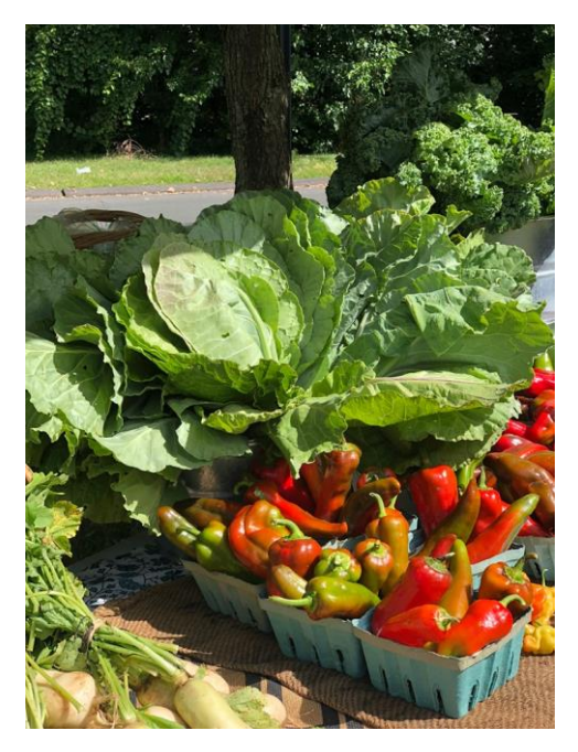
Produce being sold at the North End Farmers' Market. NEFM accepts and doubles SNAP and WIC benefits.

Building on progress achieved in 2018, the Healthy Food Access Working Group broadly shared the English and Spanish versions of a radio announcement and video promoting the use of SNAP benefits at Hartford farmers' markets. This information was shared through 89.9 WQTQ, La Mega 910, Exitos 105.3, WRTC 89.3 at Trinity College, El Show de Analeh, local WIC offices, United Way, and