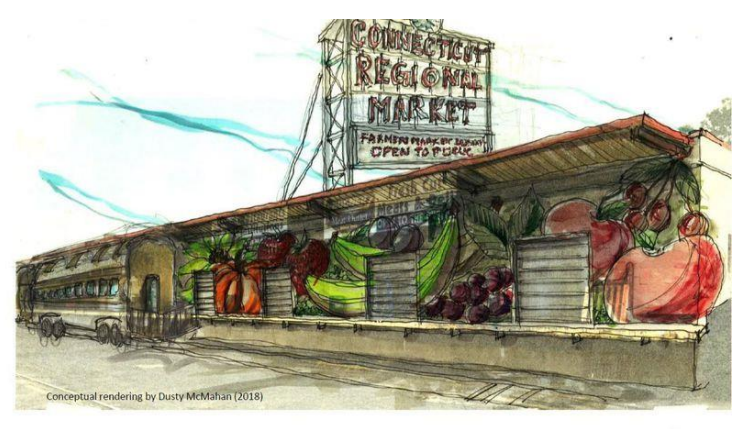
A rendering of the Hartford Regional Market.