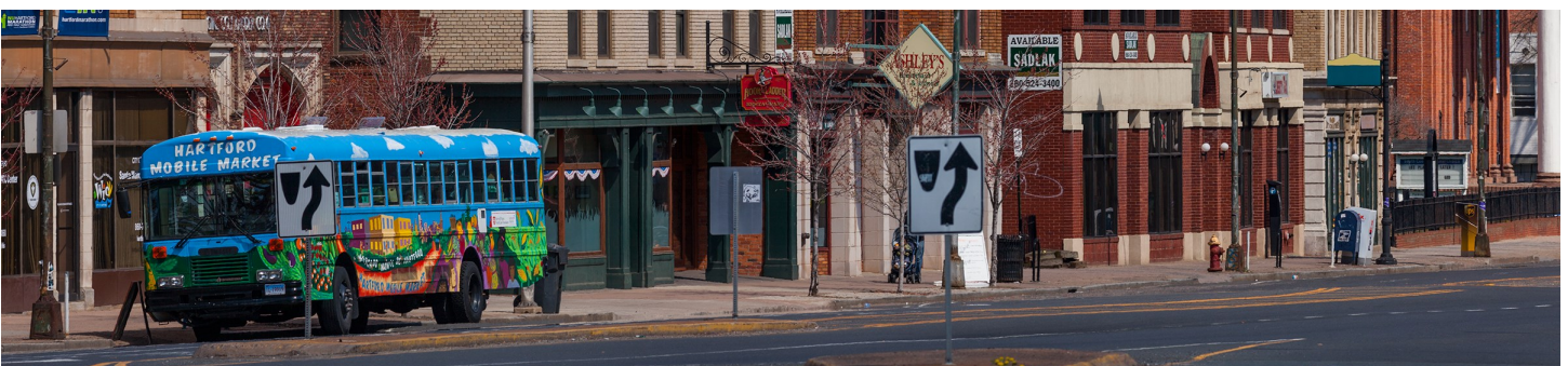
Picture 7. The Hartford Mobile Market brings fresh produce to Hartford neighborhoods.