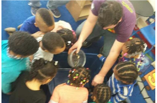
Picture 6. Food Corps member with students.

As of the spring of 2015, 24 schools in the Hartford Public School District offer some form gardening education during regular class time or through after school programming. Organizations such as Hartford Food System, FoodCorps, and the Hartford School Garden Advisory Team are working to increase this number and ensure that teachers and staff understand how to utilize these gardens in their class curriculums.