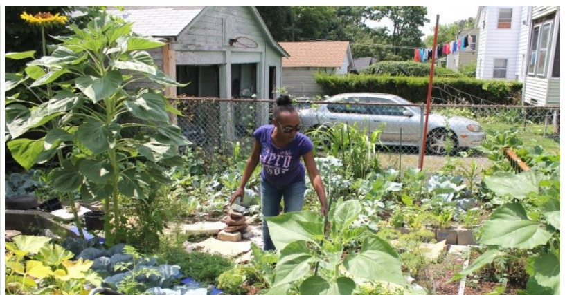
Picture 5. Urban farm using containers and raised beds.