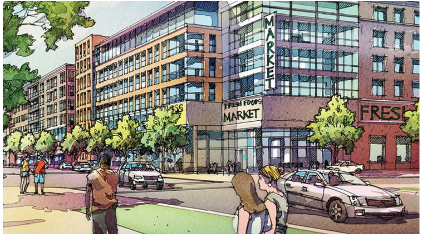
Picture 8. Rendering of a grocery store in Downtown North.

The $350 million development plans for the neighborhood just north of downtown Hartford currently include housing, a brewery, and a grocery store, in addition to the construction of the minor league baseball stadium. While fitting a grocery store that serves the needs of Hartford residents into the entertainment district being developed surrounding the baseball stadium presents significant challenges, the Commission offers the following recommendations to guide the development of the grocery store.