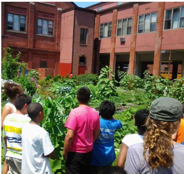
Picture 12. Community garden at Billings Forge Community Works.