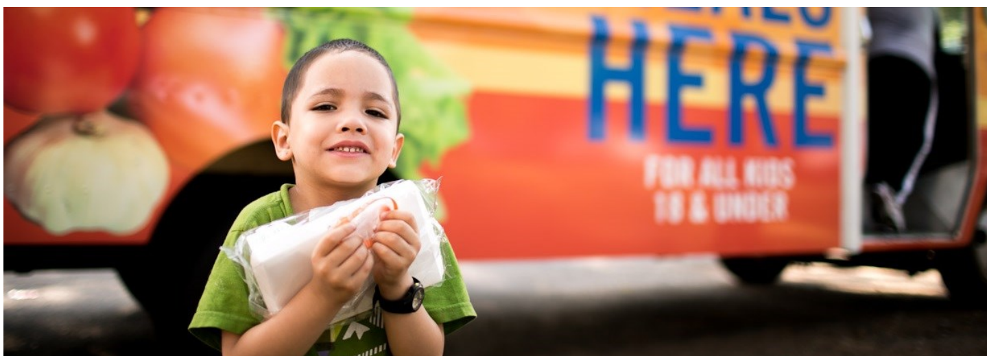
Picture 4. Summer Meals Program participant.