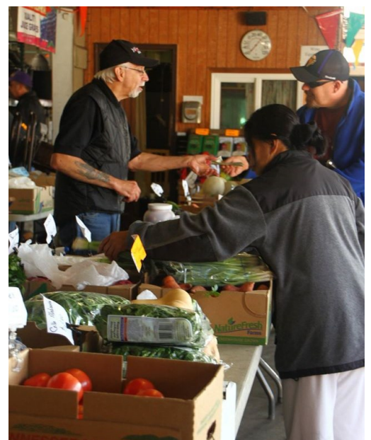
Picture 9. The Hartford Regional Market.