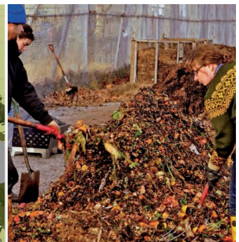
Picture 10. Anaerobic digestion facility planned for Southington.