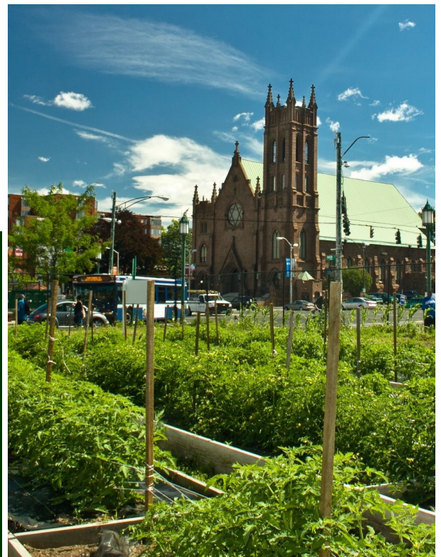
Picture 1. Grow Hartford urban farm site at the intersection of Park and Main Street.